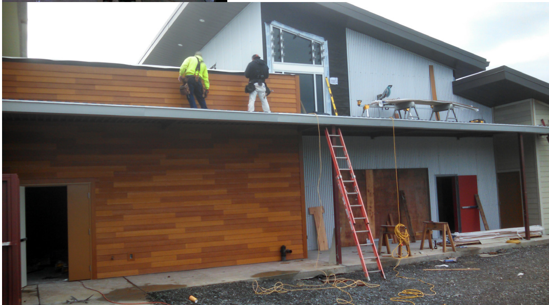
Top Photo: The roof of the Lobby/Game Area is painted after the windows and drywall were installed. Bottom Photo: Workers finish up placing the siding on the Back side of the Building.