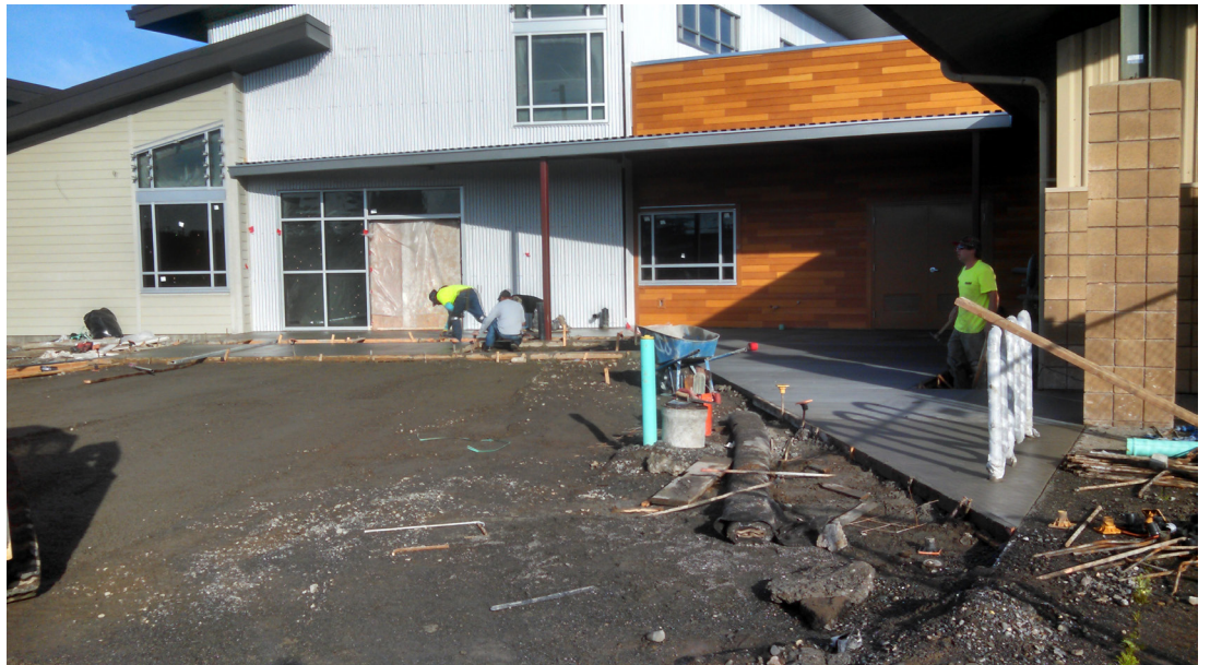
Photo Above: View of the front of the building, just to the right is the McKinleyville Activity Center. Workers lay the concrete entryway to the front of the building, after the siding was completed.

As you may or may not know the construction of the facility is funded through local ballot Measure B, but the furnishings, equipment and supplies for programs and activities must be funded through grants, donations and community support. The MCSD Parks & Recreation Department has a fundraising goal of $110,000 to furnish and equip the interior of the facility which includes the commercial kitchen, the classrooms/multipurpose room, the lounge/games area, the music room and recording studio. Currently $42,000 has been raised towards that goal. You can help raise the funds needed by making a donation and earning a leaf on the Giving Tree that will "grow" in the lobby of the facility. (see page 7 for information on how to donate)