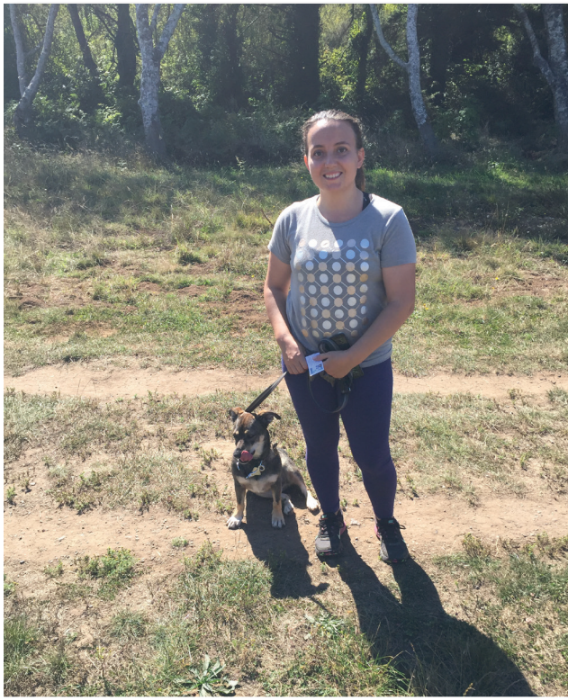
Caught Being Good @ Hiller Dog Park!! Learn more on Page 4