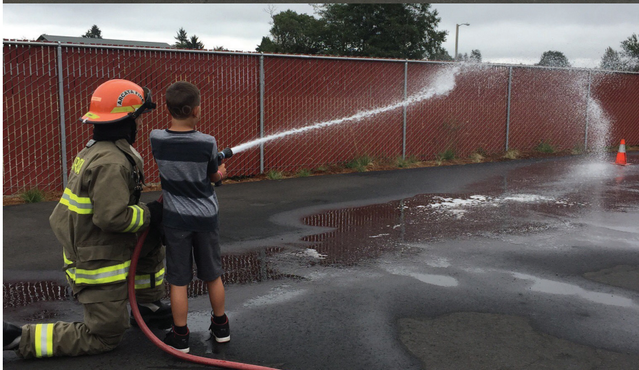
Photos above: Kids Camp Fieldtrip to the McKinleyville Fire Station this past summer.