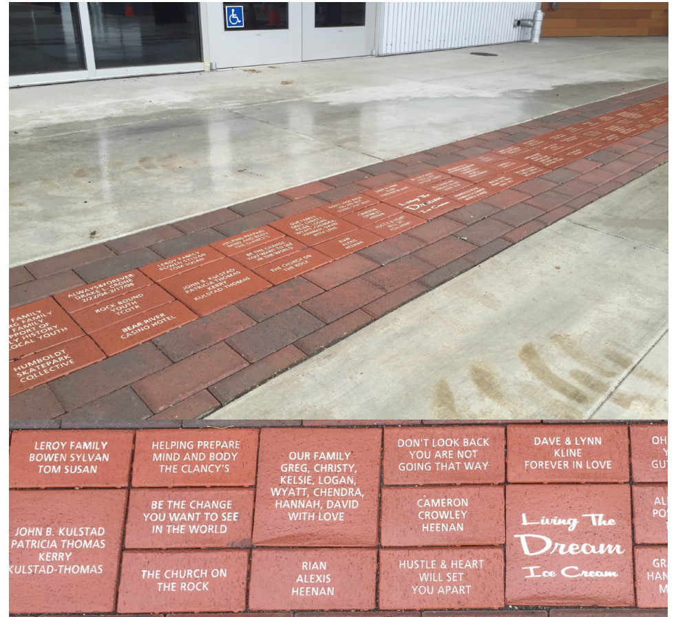
Photos Above: The first round of bricks has been placed at the entrance to the center! Thank you to all who placed an order!

A 4" x 8" brick paver with up to 3 lines of text is a minimum donation of $200. An 8" x 8" brick paver with up to 6 lines of text is a minimum donation of $500. Each line can have up to 15 letters, numbers, characters or spaces.