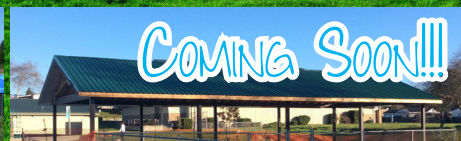
PIERSON PARK PAVILION