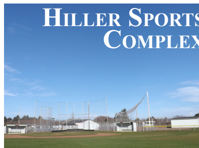
HILLER SPORTS COMPLEX