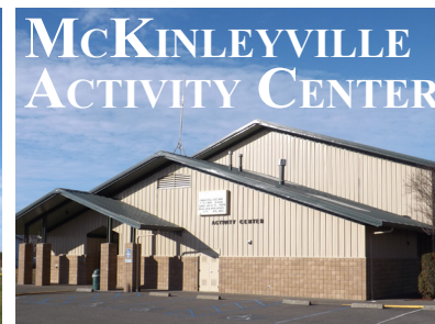
MCKINLEYVILLE ACTIVITY CENTER