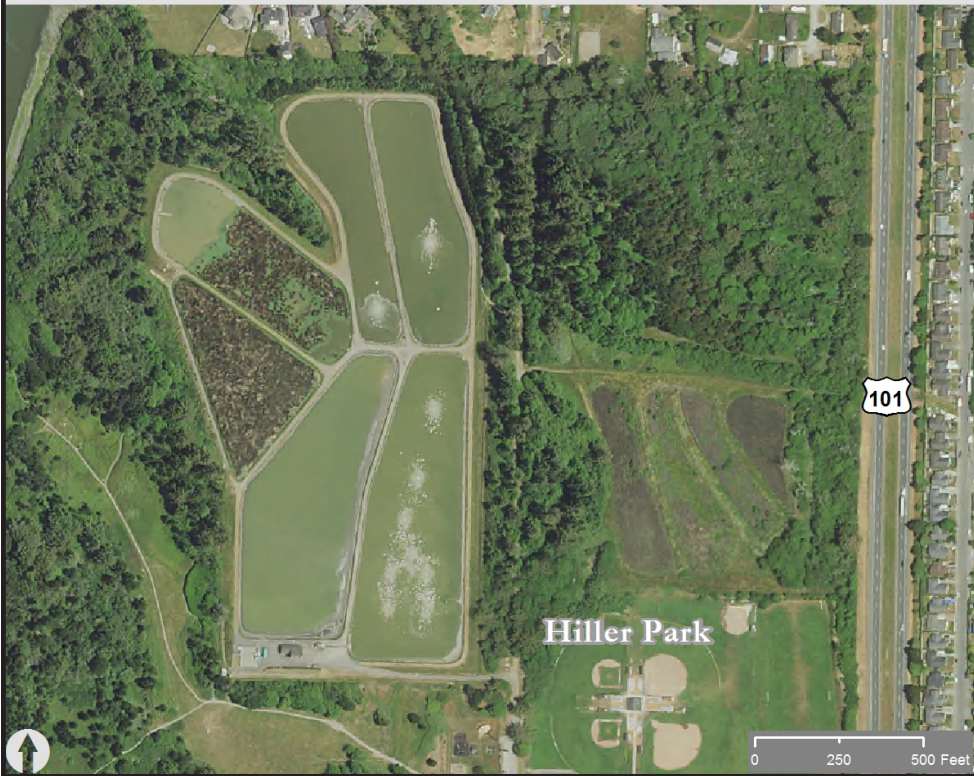
Wastewater Management Facility

Date: Tuesday December 9, 2014 Time: 4-7pm