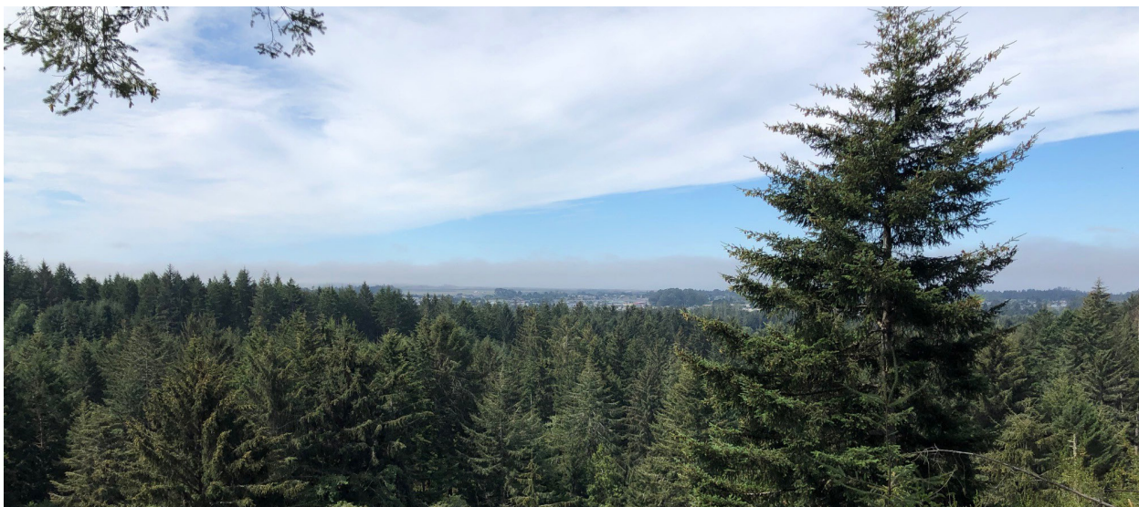
Overlooking what will be the Community Forest!