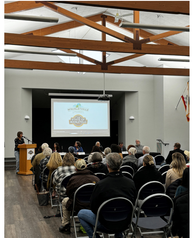
The State of McKinleyville in Azalea Hall on January 17, 2024.

My big news at the State of McKinleyville was that we are closing on the Community Forest land! The Trust for Public Land obtained a grant from the State to purchase the 599-acres from Green Diamond and Deed it to the MCSD. We closed on the land on January 31, 2024. Now the real work begins! One of our first tasks will be to finalize a Community Forest Committee consisting of MCSD Staff, forestry and other environmental professionals, and community members. We will finalize an application form for those interested in being on the Committee and circulate it on our website, etc. Look for the article in this Newsletter for additional information on the Community Forest and the Committee. We hope to get the Committee up and running this spring or early summer. This will be a working Committee that will be coming to the public soon after it is formed to start planning the development and uses that the Community wants to see in the forest. It is anticipated that these will include hiking/biking/horse trails, watershed restoration projects, reforestation projects, etc., etc.