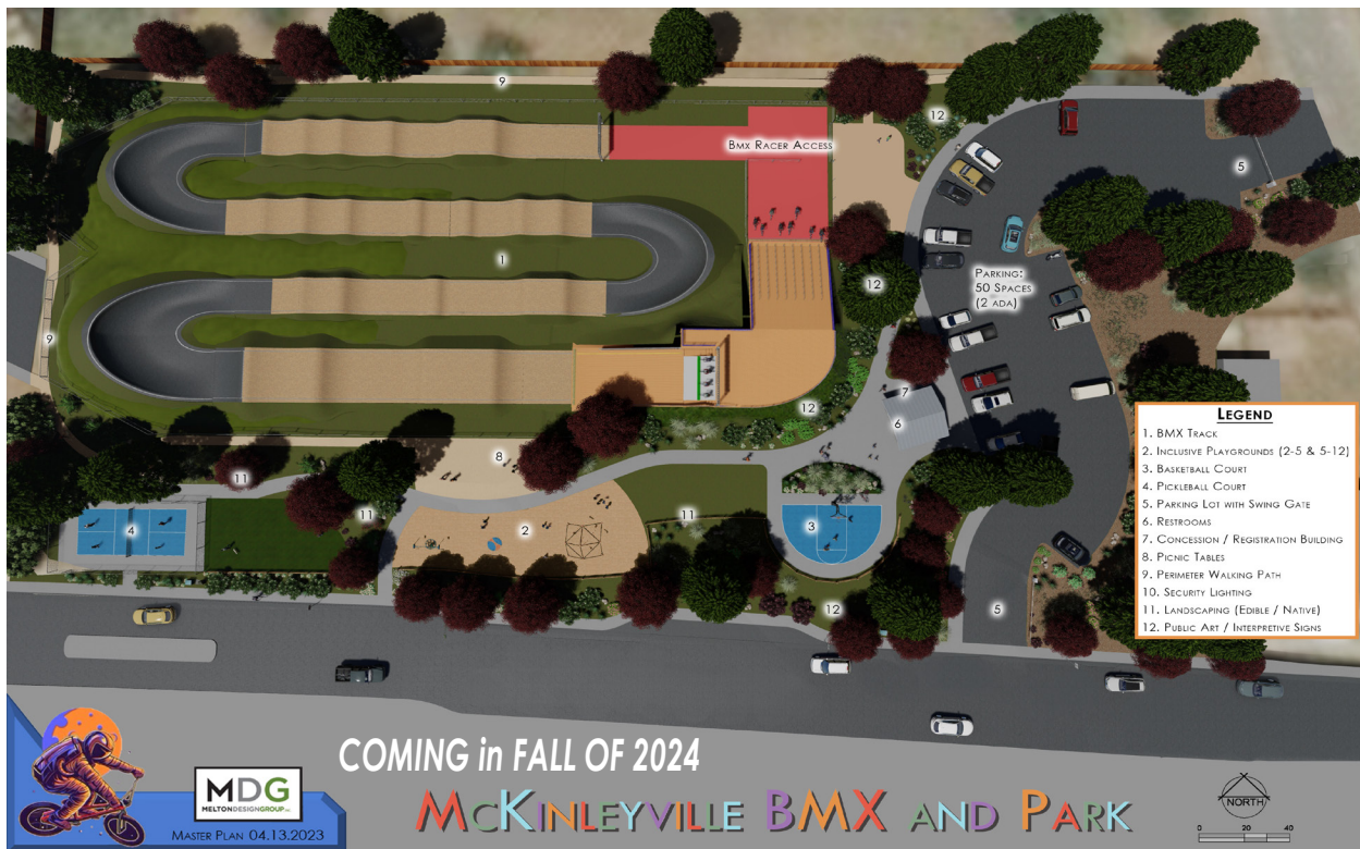
Master Plan Layout of the McKinleyville BMX Track and Park.

I also talked about the status of the BMX Park at School & Washington at the State of McKinleyville. We are finalizing that bid package, will go out to bid this spring, and start construction this summer. This is also a grant funded project and will consist of the BMX USA certified track, a playground, a pickleball court, a half court basketball court, restrooms and a concession stand. It will be a great addition to that area of town and to McKinleyville as a whole.